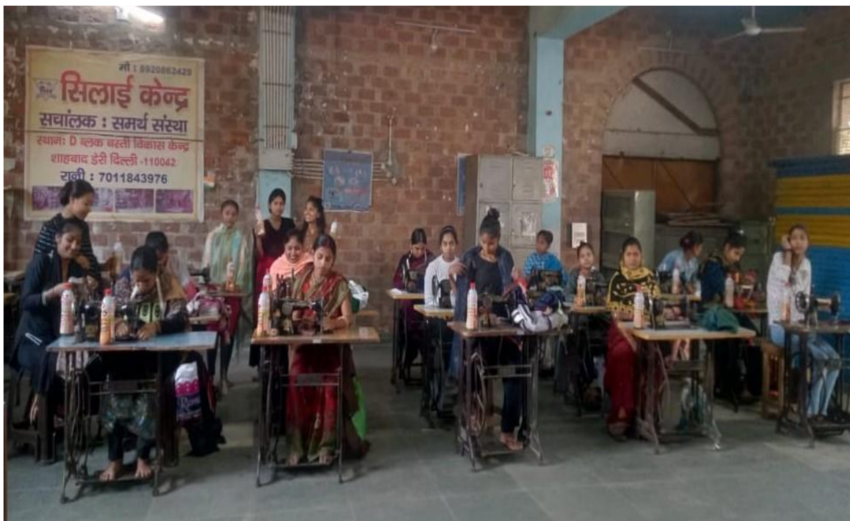
Learners are stitching