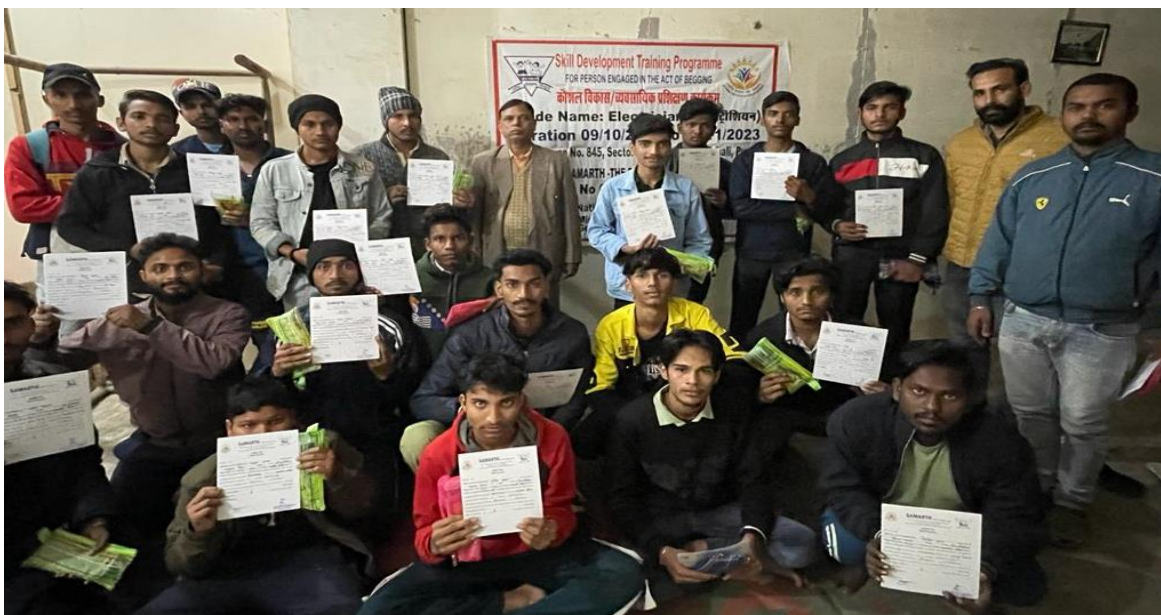
One month (9 th October 2023- 11 th November, 2023) at Punjab