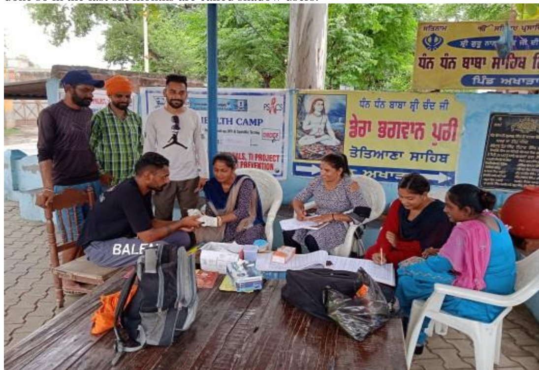
SOA Camp, IDU Project