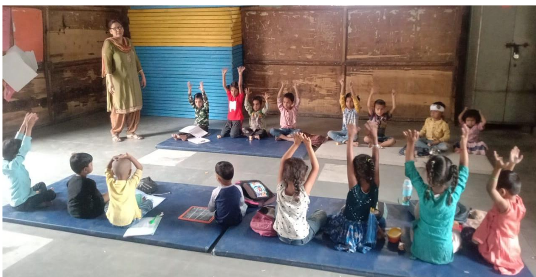
Creche Center at BVK, Shahabad Dairy, Delhi

The organization has set up & running skill development unit (Sewing Classes for 40 beneficiaries) for the women and girls belonging to the lower income groups. The age group of learners are 18 years and above. The course is offered for 6 months. The external examiners are called for the taking the examination after completion of course. The successful candidates are rewarded the certificate.