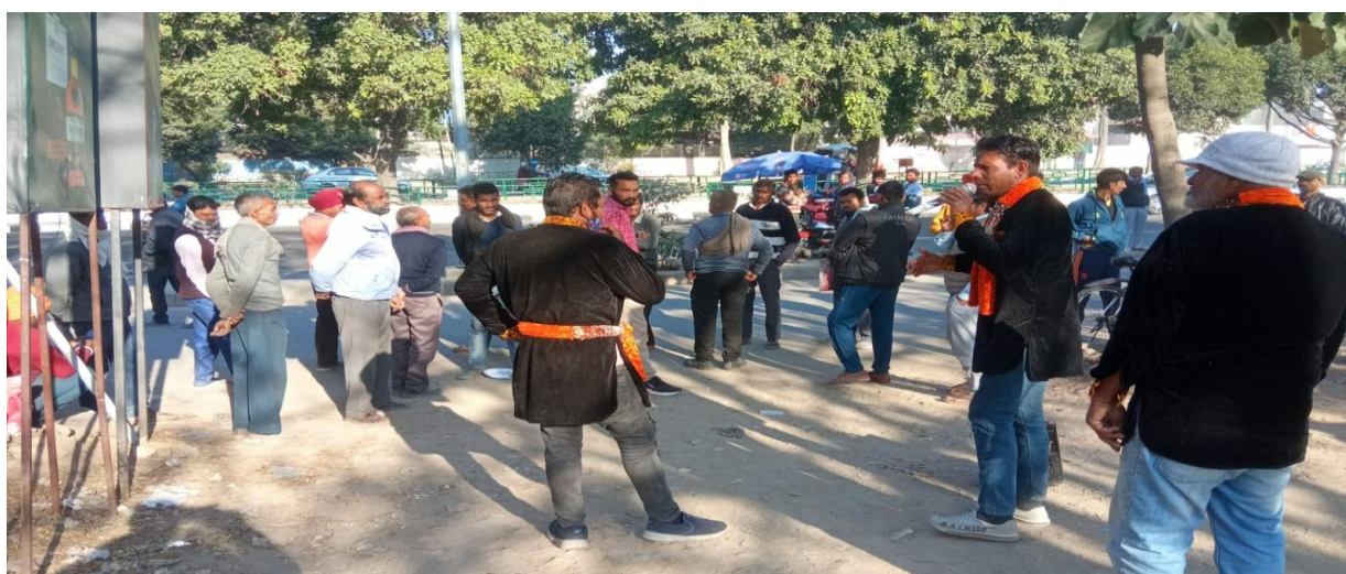
Annual Performance Tracker of TI-Migrant 2023-24 at Mohali (SAS Nagar), Punjab