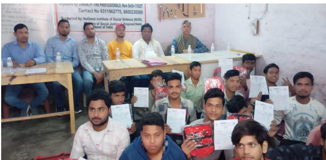
One month (9 th October 2023- 11 th November, 2023) at Delhi