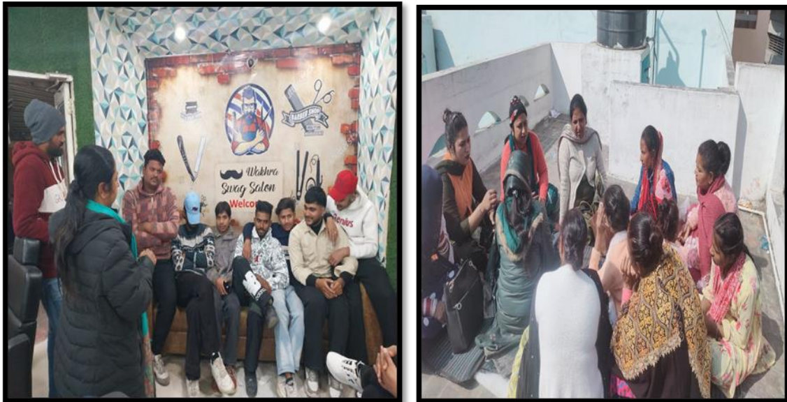
Meetings with HRGs at Gurdaspur, Punjab

It does not describe any specific kind of sexual activity, and which activities are covered by the term depends on context. An alternative term, males who have sex with males is sometimes considered more accurate in cases where those described may not be legal adults .