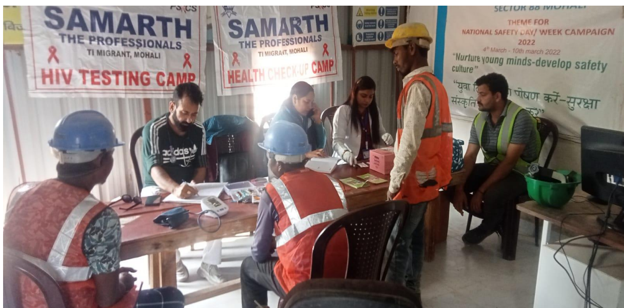
Awareness Program on HIV/AIDS-Street Plays at Labour Chowk, Mohali, Punjab